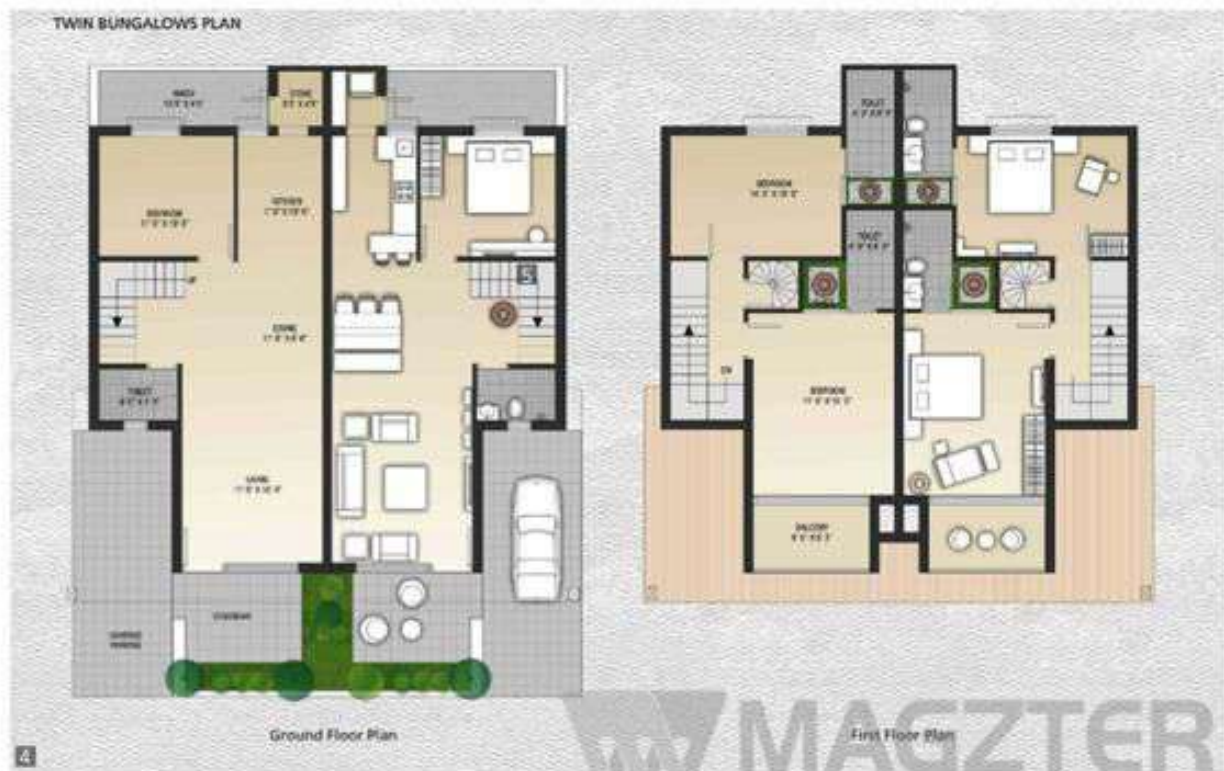
4. The bungalows at Aarya Bhagwati are designed as twin-units segregated with low height hedge at forecourt

Welcomed by a quaint cosy sit-out, the house accommodates living room, dining area, kitchen and guest bedroom