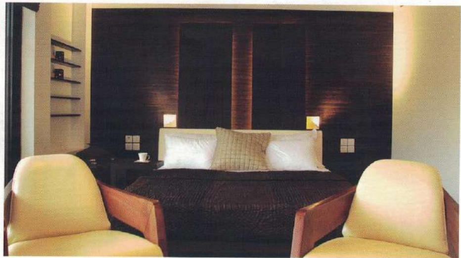
The décor of the master bedroom is subtle and graciously frill-free.