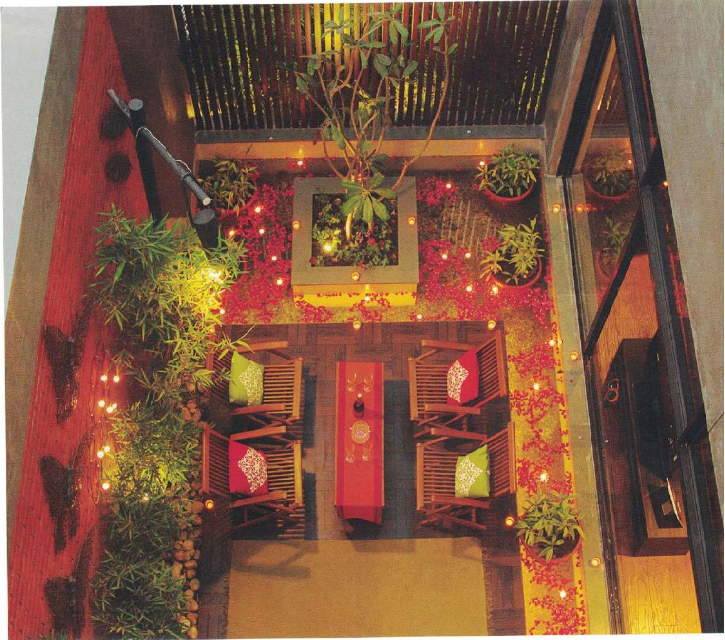
Almost each space of the house gets an opportunity to peep into the courtyard.